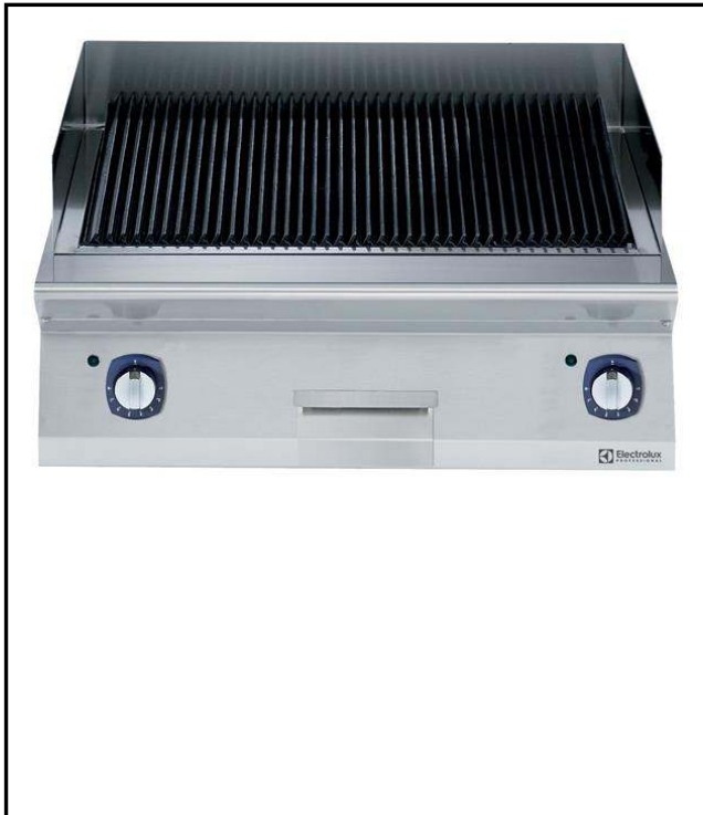
371240 (E7GREHGS0U) Full module electric Grill Top